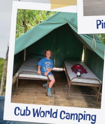
Cub World Camping